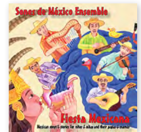
Fiesta Mexicana: Mexican songs & stories for niños & niñas and their papás & mamás ©2010