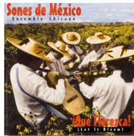
¡Que Florezca! (Let It Bloom) ©1996

Recordings by Sones de México Ensemble are distributed by ADA and available in the U.S. at Best Buy, Borders, Barnes & Noble and other retail outlets; Amazon, CDBaby and iTunes online