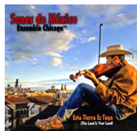
Esta Tierra Es Tuya (This Land Is Your Land) ©2007