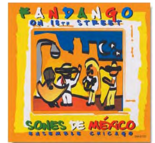
Fandango on 18th Street ©2002